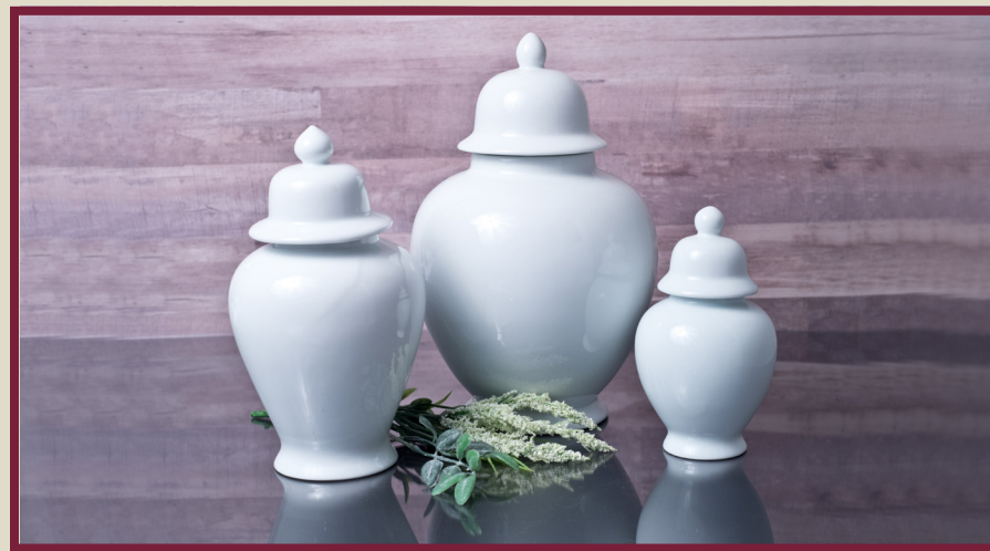
1-3 CERAMIC URN (WHITE)