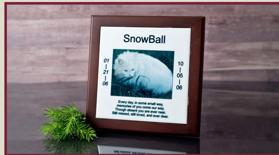
2-2 MEDIUM TILE (6"X6") WALL FRAME