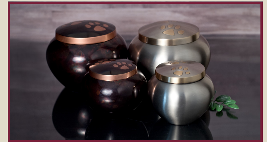
1-6 BRASS URN COPPER | PEWTER