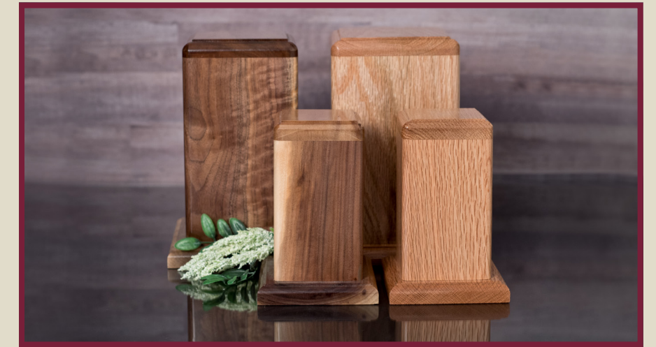
1-2 HARDWOOD URN BLACK WALNUT | RED OAK