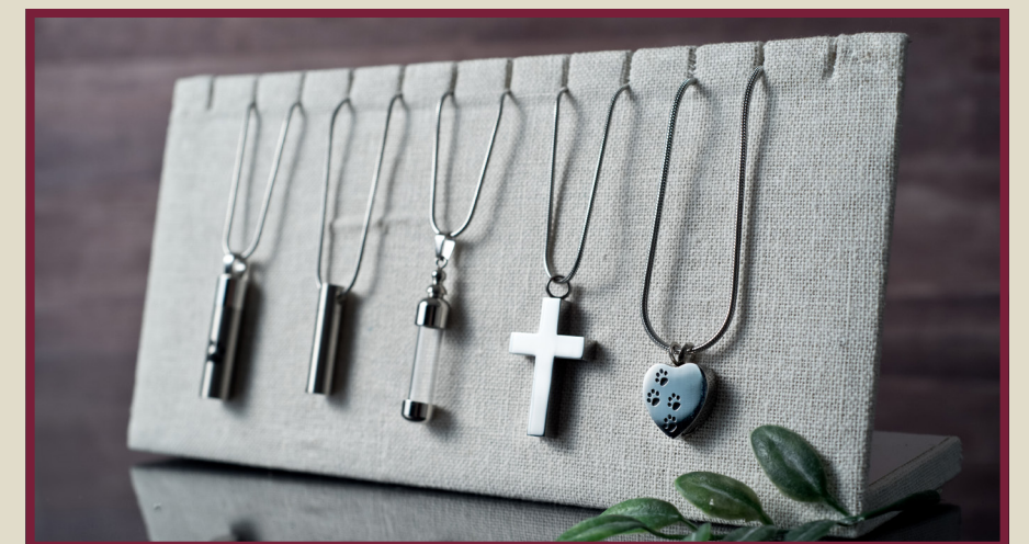
2-3 CREMATION NECKLACE