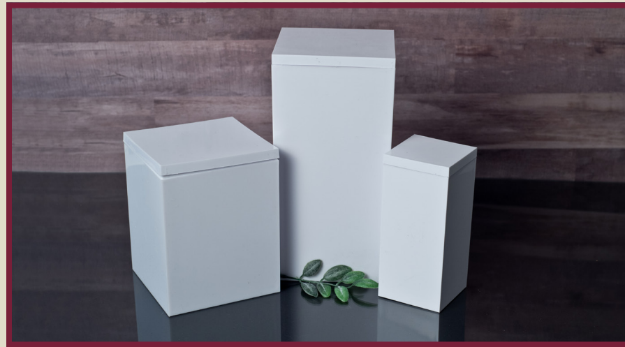
1-0 SCATTER URN