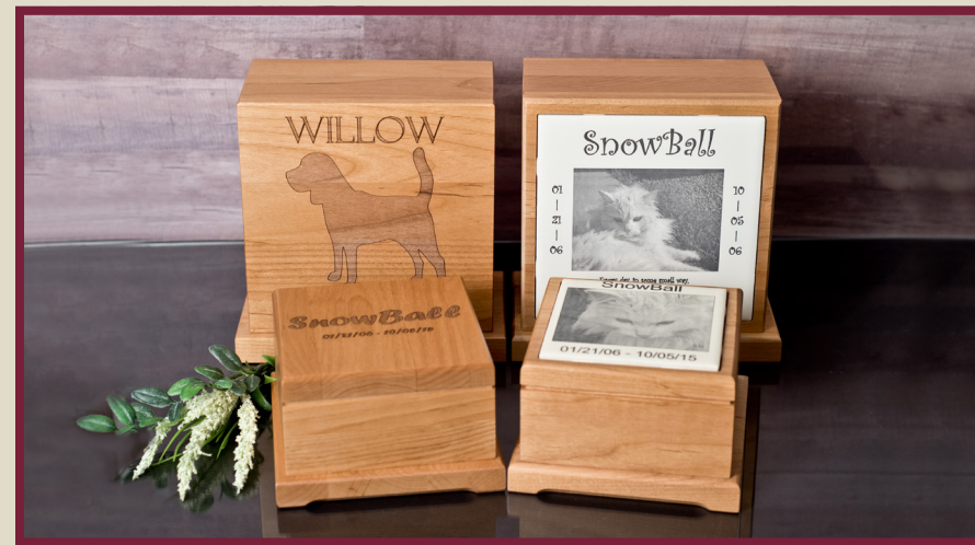
1-4 CUSTOM ALDERWOOD URN