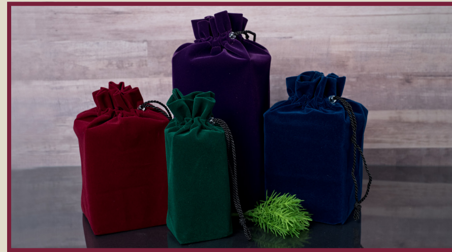
1-1 VELVET BAG