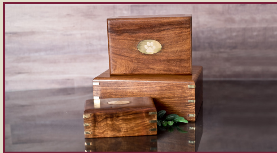
1-7 ROSEWOOD URN